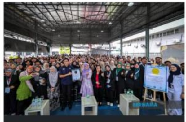
KUALA LUMPUR, Nov 14 (Bernama) -- Universiti Poly-Tech Malaysia (UPTM) has earned a place in the Malaysia Book of Records (MBR) through the 'First Youth Research Presentation on SDG' programme, which saw 500 students simultaneously presenting their research on campus today.